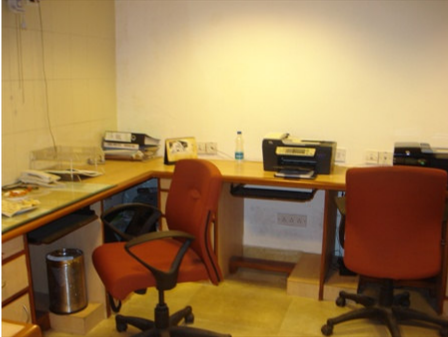
PRODUCED BY AN AUTODESK EDUCATIONAL PRODUCT